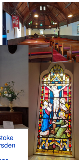
Top: St Barnabas, Stoke Above: Thomas Marsden Memorial Window Right: Frank Simmons Memorial Window