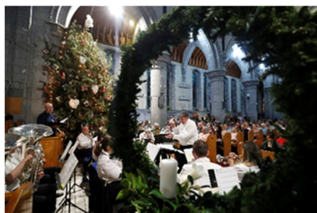
Christmas Eve Carols in Nelson Cathedral