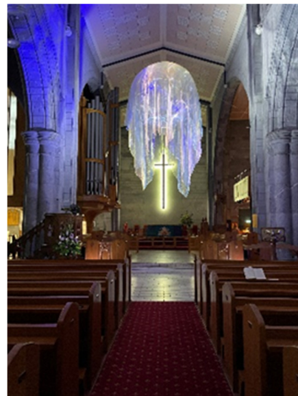
Nelson Arts Festival: Luminary