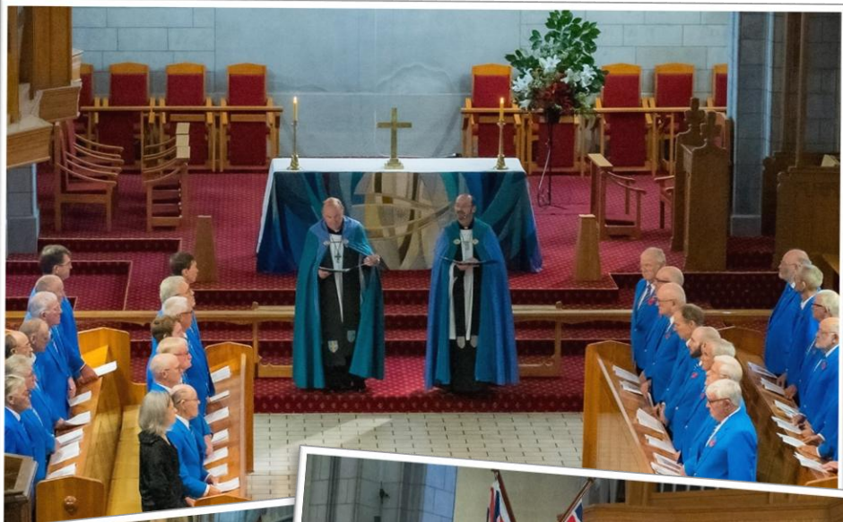
11am RSA Civic Service in the Cathedral